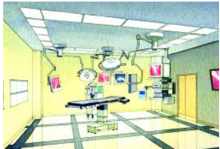
An operating room at the new UCLA Medical Center.

"(Westwood) is probably one of the most visible examples of a new replacement facility that is responding to the integrated interventional suite," Rostenberg says. Santa Monica UCLA Medical Center is still in the early phase of development.